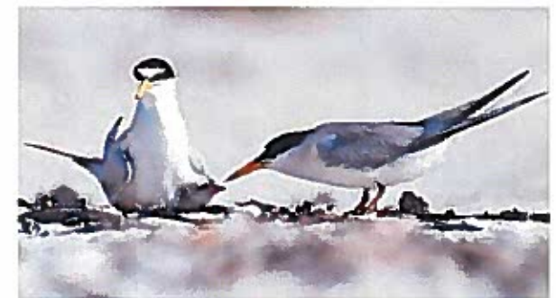
Least terns with chick.

Volunteer with your local shorebird partnership! Visit FIShorebirdAlliance.org to get involved.