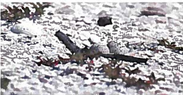
Eggs of beach-nesting birds blend in perfectly on the beach.

Populations of beach-nesting birds are declining due to significant modification and disturbance of beaches due to human activities. The fate of each delicate nest is truly critical to the survival of these birds. By being a responsible beach-user, you can help beach-nesting birds and their young survive.