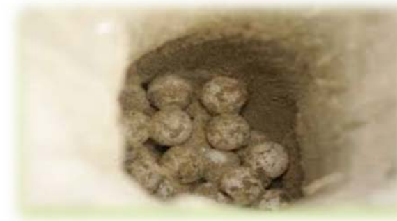
Sea turtles average 100 eggs per nest.